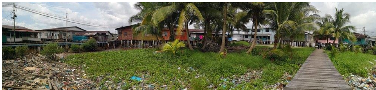
Figure 2. Panoramic view of Bakut Pekan Lama (BPL)