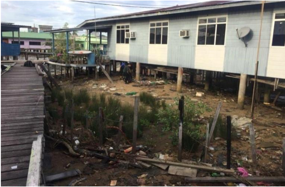
Figure 5. Bakut at Kg. Peramu (KP) with wooden fences, purun grass and a young mangrove trees around its edge. Note the concrete-reinforced stilts introduced during the Rapid Growth period