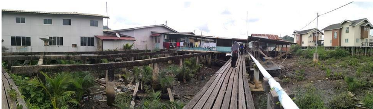
Figure 4. Panoramic view of Kg. Saba Tengah (KST). Note the young mangrove and coconut trees growing on the bakut, as well as the trash accumulated

In KST, the bakut is a large sandy island that is occasionally submerged during the highest tides (see Figure 4). According to the informants, it was formed from a combination of: (a) natural wave activity that transported sand to the island; and (b) the accumulation of waste (mollusk shells, wood/bamboo shavings and household waste) discarded by the villagers. As such, it may not be a true bakut, as the island formed naturally with human modification a by-product of the life and activity of the villagers, and their contribution to its growth was mainly by way of disposal of unwanted materials and not a deliberate construction. The bakut is most likely a sand bar formed by sedimentation rather than wave activity; this is a common depositional feature found along the edge of an estuary. Similar bakuts can be found to the east and west of it, as though it was part of a set, as is characteristic of sand/mud bars in estuaries. The KST bakut has a balai (community hall) built on stilts. It was 8,500 m 2 in size in 1955 and is still about the same size (8,100 m 2 ) today, but with its centre shifted 90m southwards away from the main channel.