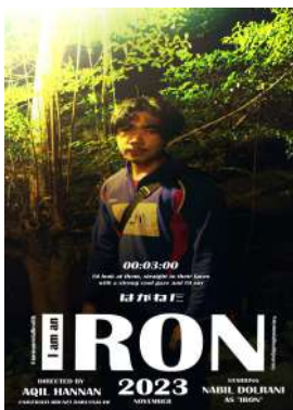
Best Social Media Content Award

The Award Ceremony was held on 7th November 2023. Notably, this edition introduced a Social Media Content competition focusing on Mental Health, receiving 17 submissions - a competitive category with a significant portion of total entries. The participating institutions included Mahakarya Institute of the Arts Asia, Politeknik Brunei, Universiti Brunei Darussalam, Universiti Islam Sultan Sharif Ali, Bangkok University, Srinakharinwirot University, and King Mongkut's Institute of Technology Ladkrabang.