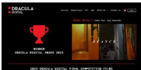
Séance (2023) won the Dracula Digital 2023 Award