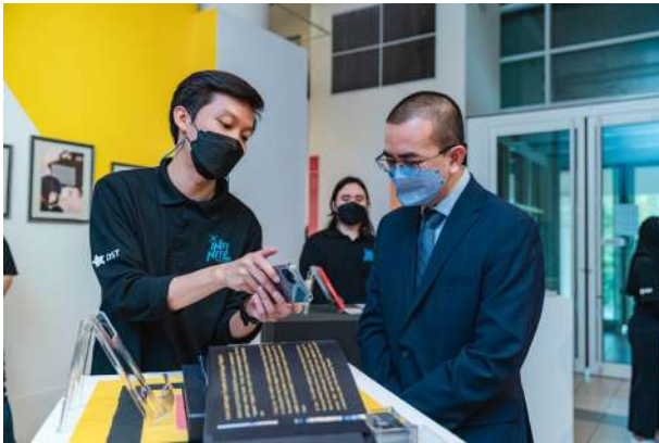
A DCI student showcasing his work

named Cyan, Amber, Ruby, and Ashen, each having its own distinctive traits and personalities. These iconic mascots were born out of a necessity to communicate and engage with the audience creatively and playfully whilst acting as a marketing technique. As such, these mascots have made consistent appearances on Spectrum's social media platforms and official merchandise collection, consisting of tote bags, pens, pencils, limited edition INFINITE Eid Envelopes and INFINITE Stickers.