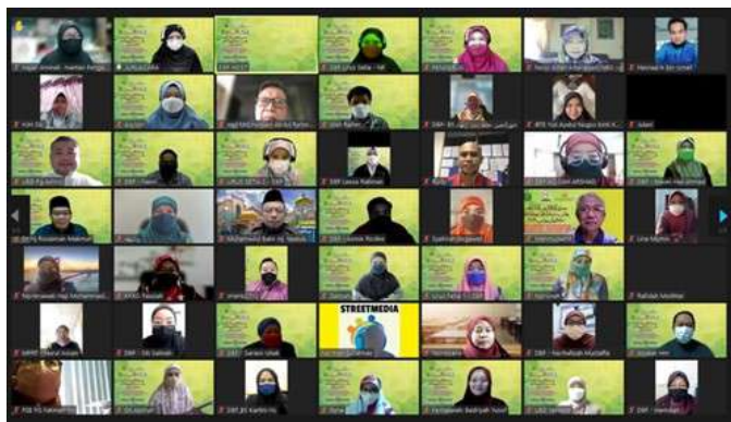
Attendees at the 7th congress session

Her paper outlines the potential for translation as an industry in Brunei, highlighting the current translation climate in the government ministries and centres, particularly the Language and Literature Bureau, education institutions, as well as in non-government sectors. Within the framework of Islamic Governance, Dr Badriyah recontextualized the merits of the Abbasids Translation Movement into the current translation scenario and discussed the prospects of implementing this success at all governing levels involving human capacity, knowledge, and infrastructure including technology.