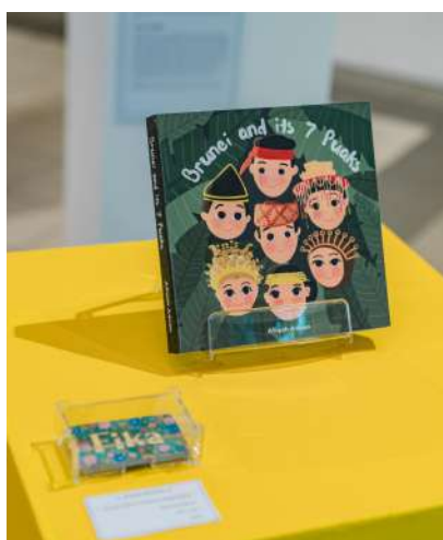
Student's illustration of Brunei and its 7 Puaks

UBD Spectrum 2022: INFINITE is organised by fifty-three final year students from the Design and Creative Industries (DCI) programme as their graduation exhibition. The exhibition is categorised into eight different creative clusters – Product Design, Digital Arts & Design, Media Production, Fine Arts, Installation, Publication, Conceptual Architectural & Interior Design , and Fashion & Textiles . After months of rigorous planning, the exhibition finally opened its doors to the public on 23 rd May 2022.