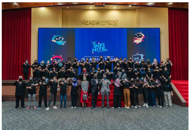
The DCI students behind UBD Spectrum 2022 and their lecturers

The event is held in compliance with the Ministry of Health's current guidelines and standard operating procedures (SOP) for COVID-19. For more information and updates regarding the Spectrum 2022: INFINITE exhibition, follow @ubdspectrum on both Instagram and Twitter.