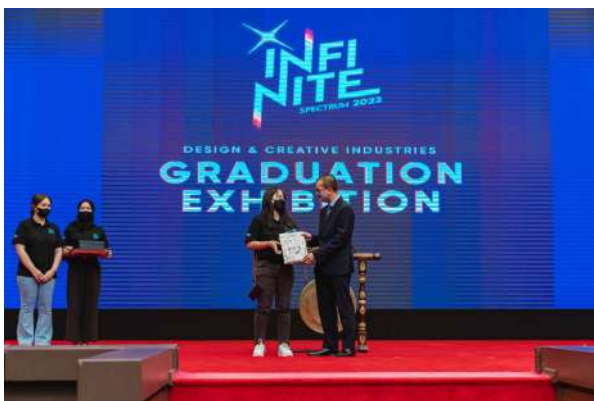
The Vice-Chancellor of UBD at the opening ceremony