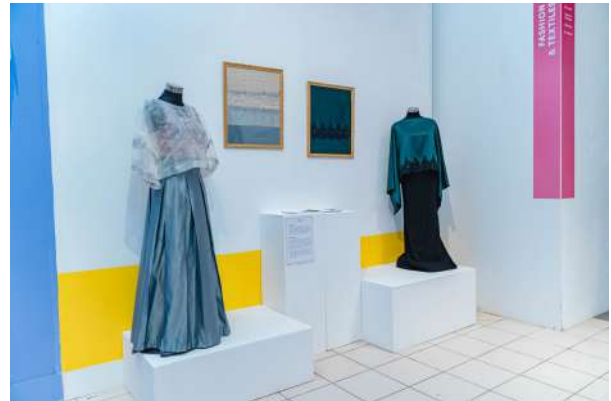
More creative work on display

The UBD Spectrum 2022: INFINITE Exhibition will be held until 23 rd June 2022, on Mondays to Thursdays and Saturdays with operating hours starting from 9:00AM to 12:00PM and 2:00PM to 4:00PM. Entry to the exhibition is free of charge and is open to the general public. Throughout the one-month long exhibition, each creative cluster will hold Gallery Talks , where students discuss the creative journey of their respective projects, following the research, ideation, and development that went into its final conceptualisation and production.